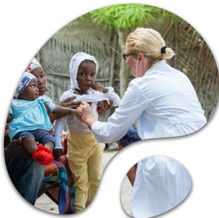
Ensuring medical equipment in Kenya

Projects, eligible for co-financing under the above-mentioned invitation, are projects in the following fields: fight against climate change, with an emphasis on the sustainable management of natural and energy resources, environmental protection, reduction of poverty and inequality, empowerment of women, improvement of social inclusion and acceleration of the green and digital transition.